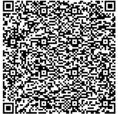
Course : Richfield - Red

Scan this QR to load the course into the App