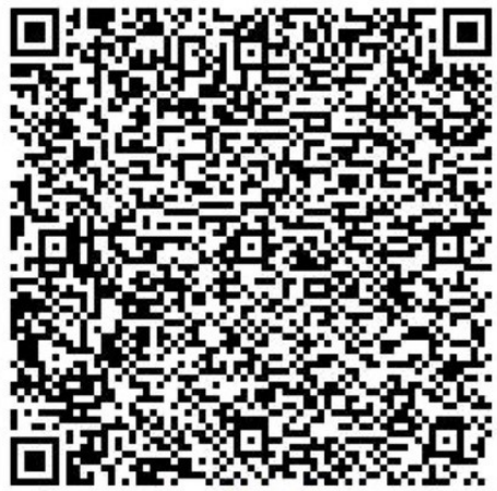
Course : Quail - Red

Scan this QR to load the course into the App