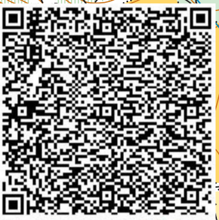
Course : Tuscazoar Classic 2020 - Orange Scan this QR to load the course into the App